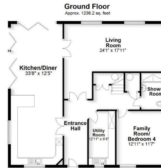
Ground Floor Approx. 1236.2 sq. feet